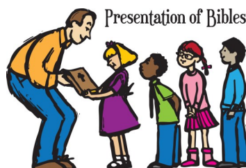
Presentation of Bibles